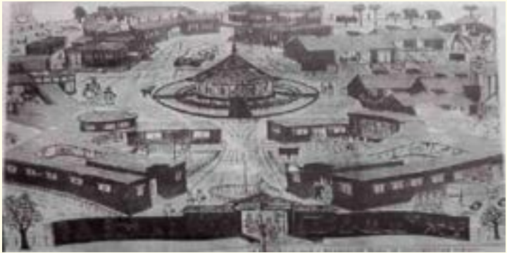
A Panoramic Sketch View of Literacy House